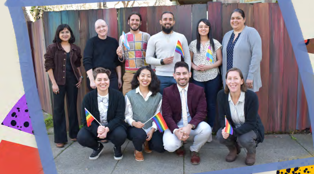
BERKELEY OFFICE TEAM

Oasis Legal Services proudly provides quality, holistic and trauma-informed legal immigration services to under-represented, low-income LGBTQIA+ immigrant communities. We have over 80 years of combined professional experience in immigration legal services, and provide legal assistance with asylum, residency, naturalization, VAWA, and family petitions. In addition to this direct legal representation, Oasis also provides case management and other psychosocial supports to clients. We are an independent, nonprofit 501(c)(3) organization.