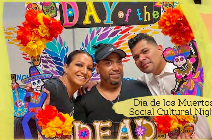
Dia de los Muertos Social Cultural Night