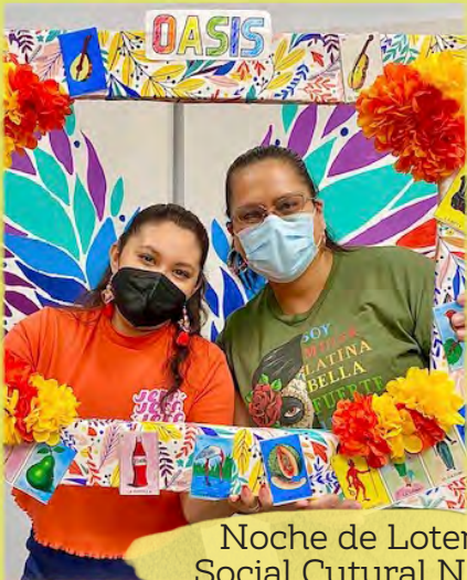
Noche de Loteria Social Cultural Night