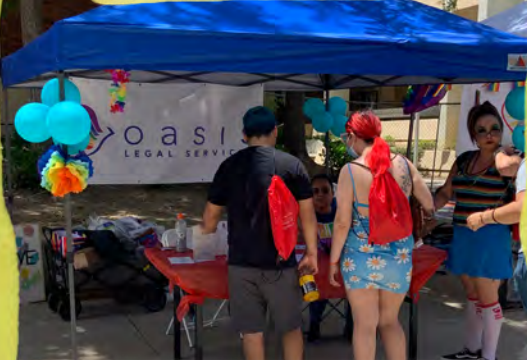
Central Valley Pride